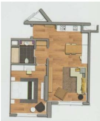
EXECUTIVE PREMIUM ONE BEDROOM APARTMENT 78 m 2