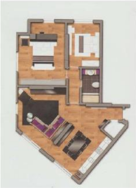
SUPERIOR CORNER TWO BEDROOM APARTMENT 142 m 2